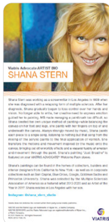
Artist Bio Card

Included inside the VIATRIS ADVOCATE Welcome Pack you'll find: