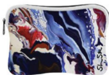
Neoprene Sleeve Front