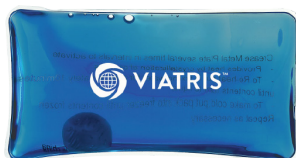
Hot Cold Gel Pack Front