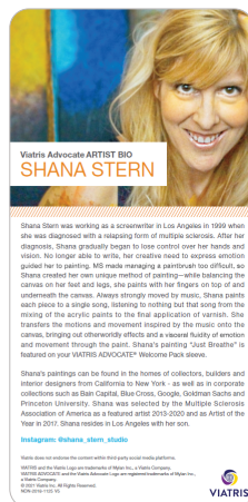
Artist Bio Card

Included inside the VIATRIS ADVOCATE Welcome Pack you'll find: