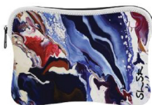
Neoprene Sleeves Front